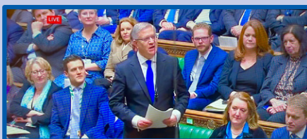
Andrew Rosindell M.P. Speaking up for Romford in the House of Commons.

0207 219 8475 (Westminster) 01708 766700 (Constituency) @andrew.rosindell.mp@parliament.uk www.rosindell.com Andrew Rosindell MP @AndrewRosindell