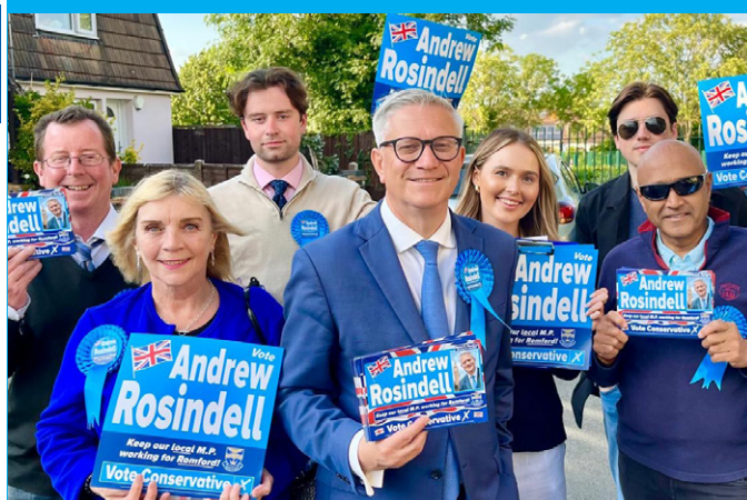
Andrew Rosindell M.P. and his team campaigning in Hornchurch during the General Election

Andrew Rosindell M.P. would like to thank all the people of Romford for their support earlier this year in re-electing him as our local Member of Parliament. Romford remained a Conservative seat, despite the predications of a Labour "gain". Andrew is truly grateful for the personal support he received from so many local residents who voted in large numbers to keep him as our M.P. Since his return to the House of Commons, Andrew has been hard at work, speaking up for Hornchurch and Romford and standing up for Britain! Our M.P. is always here for us whenever we need him to fight our corner and support local people!