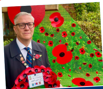
Andrew Rosindell M.P. lays a poppy wreath on behalf of the people of Hornchurch and Romford on Remembrance Sunday